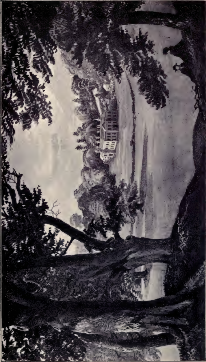
REDLYNCH HOUSE, SOMERSET.